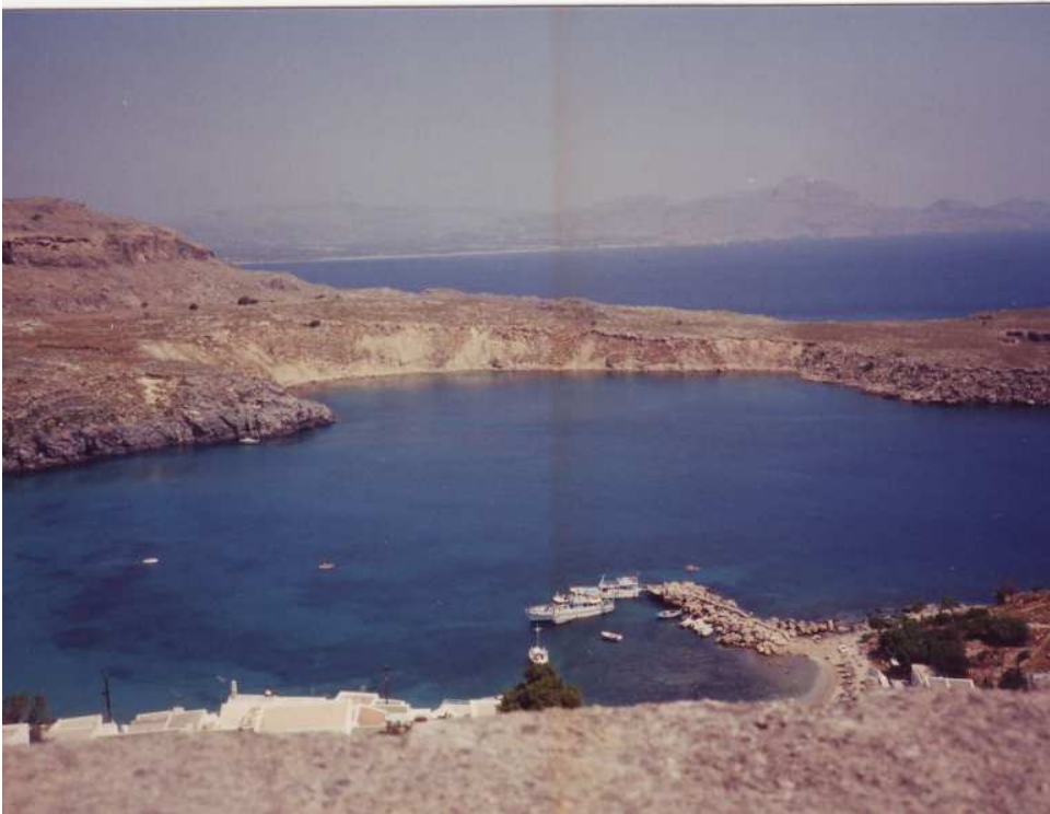
Above: the Generals' palace in Rhodes. Below: the deep blue bay as seen from the top of the hill in Lindos.