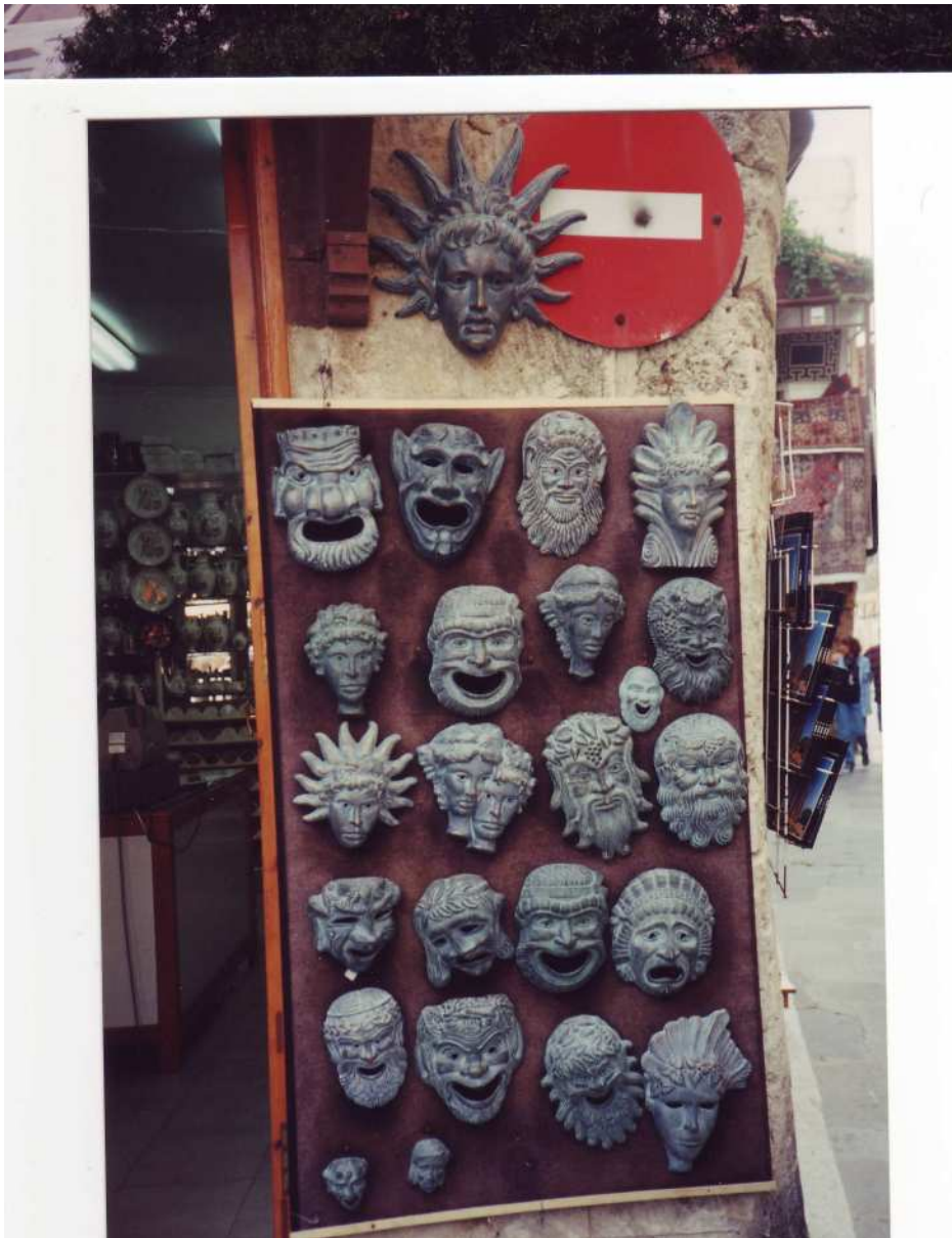
Rhodes: A collection of ceramic masks in a souvenir shop