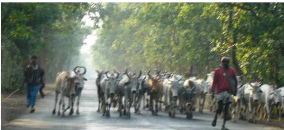
Bringing the cattle home from a pasture at sunset, along a paved road