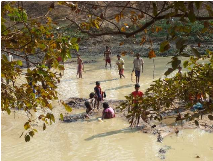
Men and women of all ages are trying to catch small fish with their small nets in a shallow river; look closely to see the nets hanging from their right hands. The children sometimes use small pieces of thin fabric instead of nets.